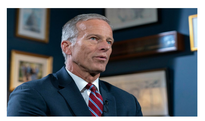
53 to 47 Senate GOP Majority