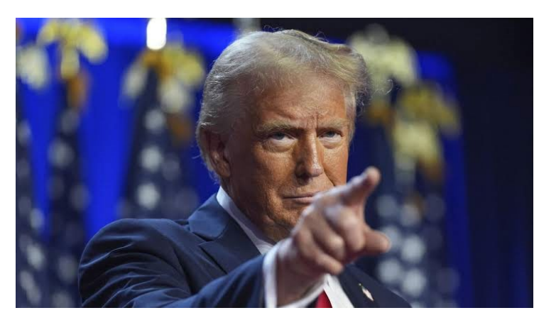
Trump White House