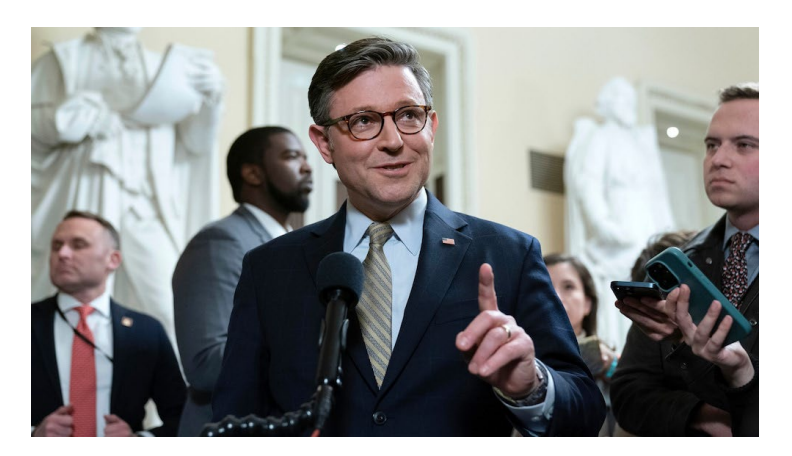
219 to 215 House GOP "Majority"