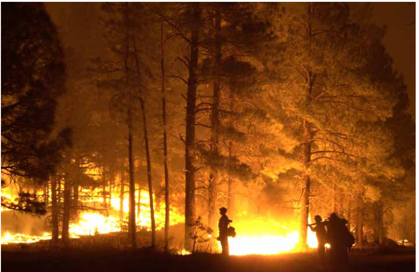
The Rodeo-Chediski Fire of 2002 burned nearly 500,000 acres in east-central Arizona and was a key ecological event that helped spur the passage of the Healthy Forests Restoration Act.