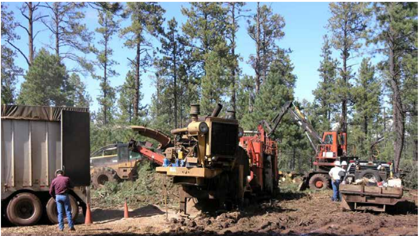
Forest restoration work is conducted on the Apache-Sitgreaves National Forest under the White Mountain Stewardship Contract. The WMSC was the largest 10-year stewardship contract in the nation and served as a testing ground for the use of stewardship contracting.