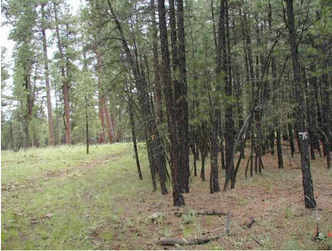
A dense, dog-hair thicket of Ponderosa pine stands in contrast to a more open, restored forest in the G.A. Pearson Natural Area within the Fort Valley Experimental Forest. Evidence gathered here in the 1990s by forest ecologists, including Wally Covington of the Ecological Restoration Institute, bolstered the need for science-based forest restoration.