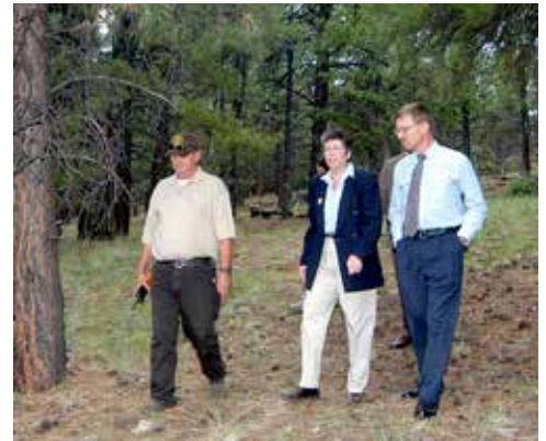
Arizona Governor Janet Napolitano visits a restoration project near Flagstaff in 2004. Her support for forest restoration efforts across the state energized members of the Forest Health Advisory Council and the Forest Health Oversight Council and fueled a productive time in the events that led to the formation of 4FRI.

2005: The Arizona Governor’s Forest Health Advisory Council and the Governor’s Forest Health Oversight Council select a subcommittee, led by Aumack and Sisk, to frame a 20-year forest strategy for Arizona.