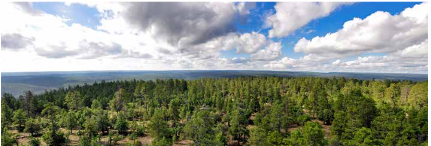
Northern Arizona is home to the largest contiguous ponderosa pine forest in North America. The Four Forest Restoration Initiative, known as 4FRI, was formed as a collaborative effort to restore forest ecosystems on portions of four Arizona National Forests, which include the Apache-Sitgreaves, Coconino, Kaibab, and Tonto.